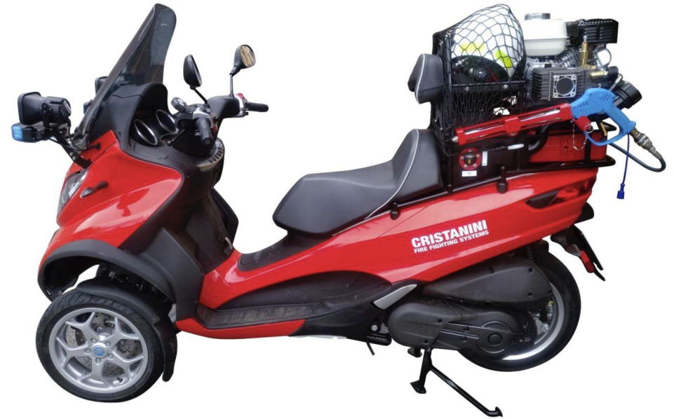
MP3 outfitted with Mini Fire Stop by Cristanini