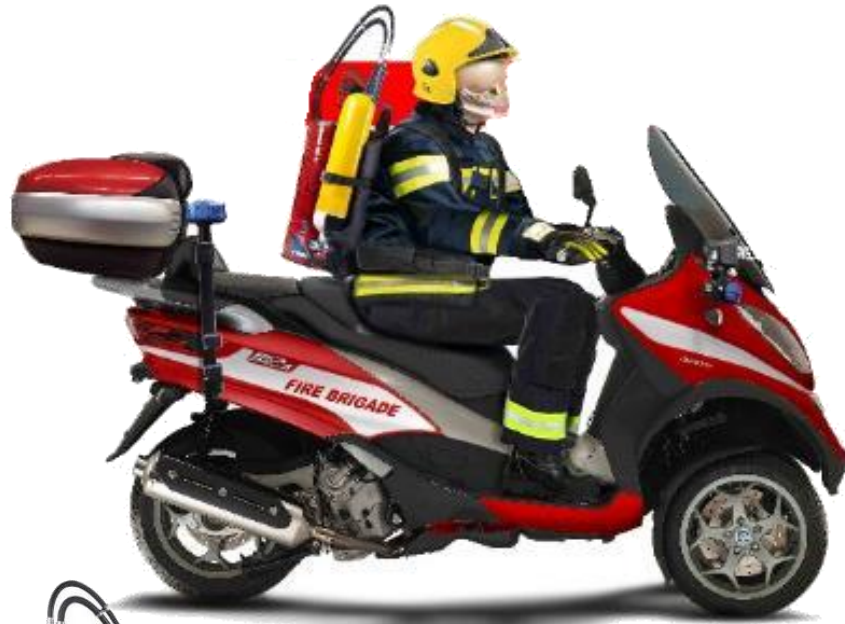
Fire extinguisher backpack