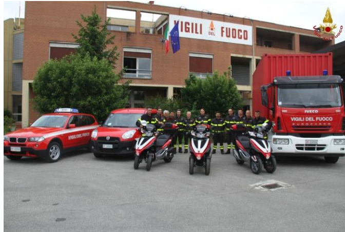
ITALY FIRE BRIGADE (Piaggio MP3 500cc)