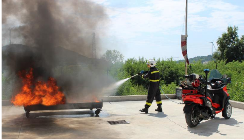
CRISTANINI ITALIA (Piaggio MP3 500cc)