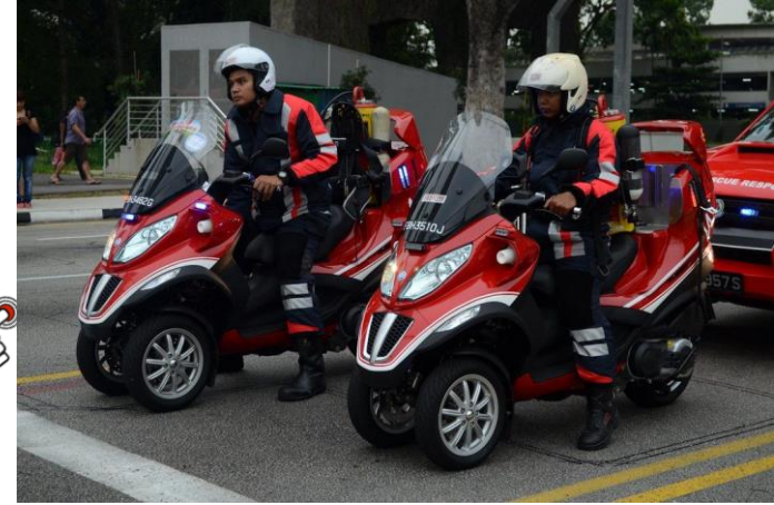
SINGAPORE FIRE BRIGADE (Piaggio MP3 300cc)

To watch the video click on the images, make sure you have an internet connection