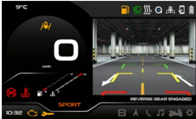
Rear video camera image