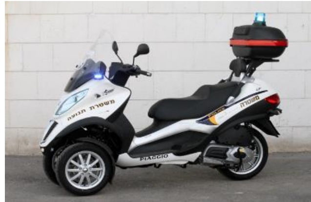
ISRAEL – POLICE DEPT (Piaggio Mp3 300cc)