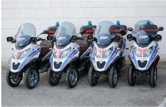
ISRAEL – ARMY (Piaggio Mp3 500cc)