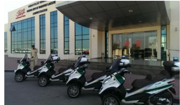
EAU DUBAI – POLICE DEPT (Piaggio Mp3 500cc)