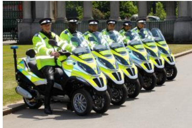
UK - METROPOL POLICE DEPT (Piaggio Mp3 300cc)