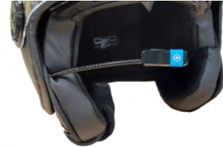
Bluetooth communication system