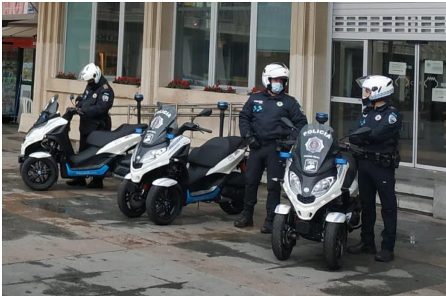
SPAIN – LOCAL POLICE (Piaggio Mp3 300cc)