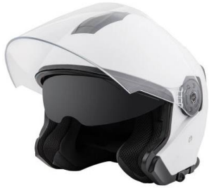
PFJ Jet Helmet