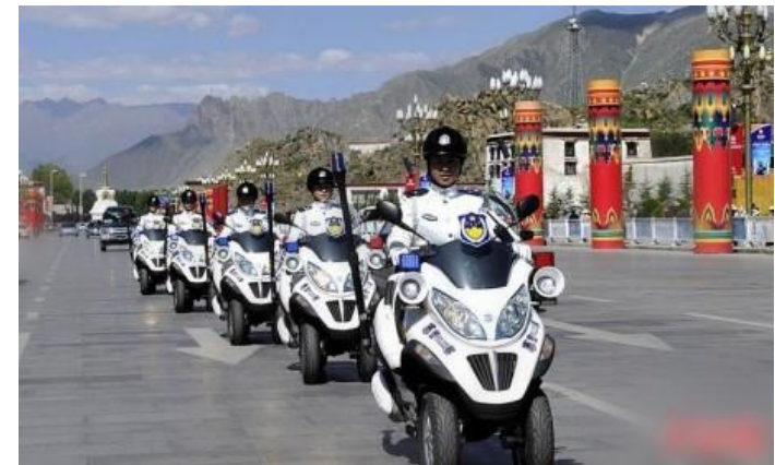
CHINA - POLICE DEPT TRAFFIC POLICE (Piaggio Mp3 300cc)