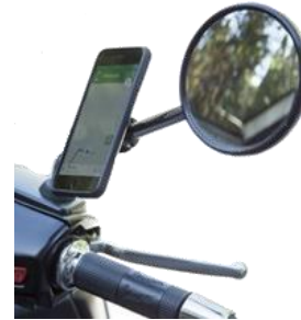
Smartphone support kit